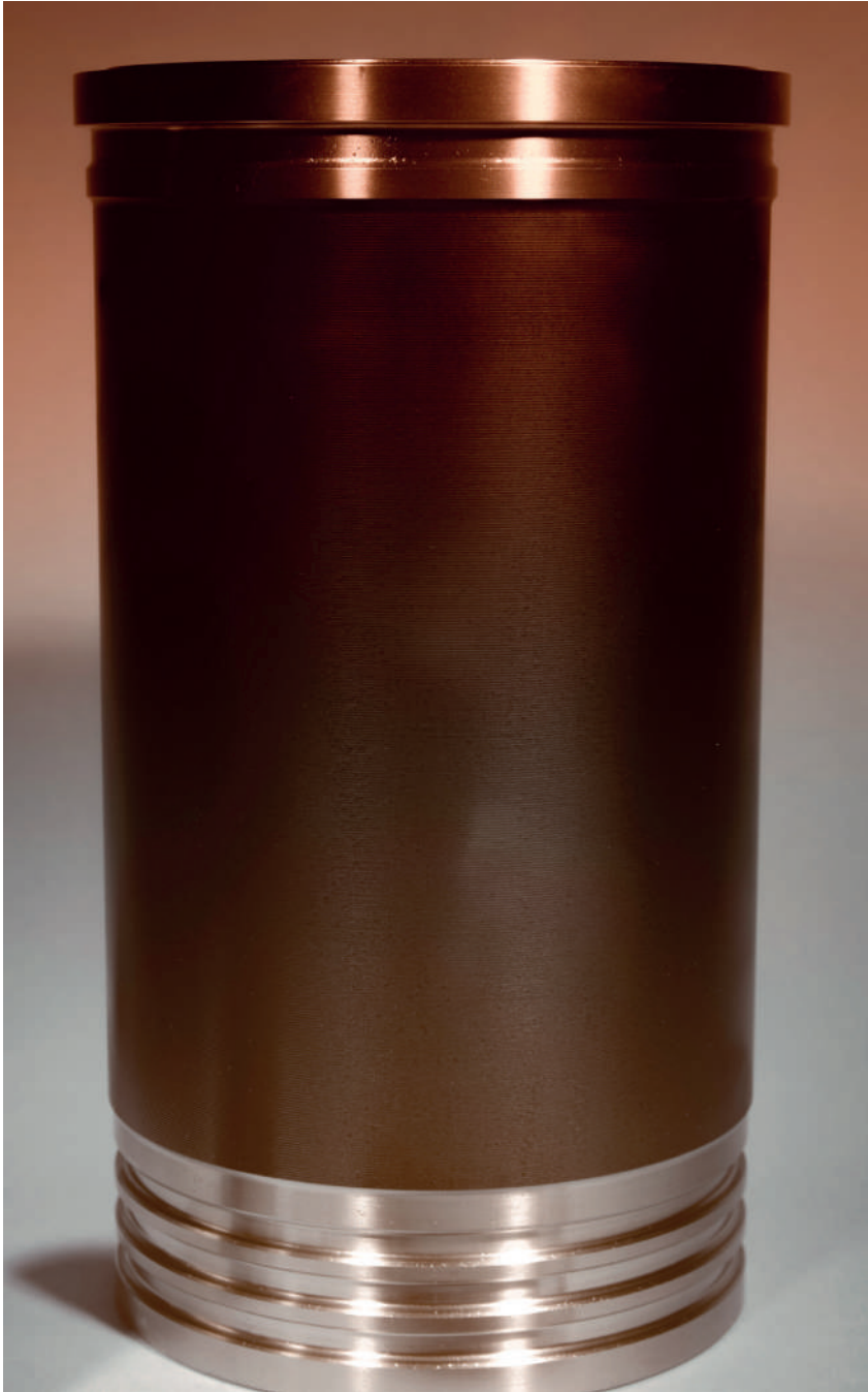
Liner Cross Hatch